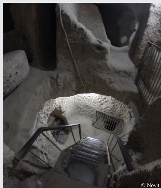
Photos from top: Cappadocia, hot-air balloon ride in Cappadocia, Whirling Dervishes, looking down into the Kaymakli Underground City tunnels