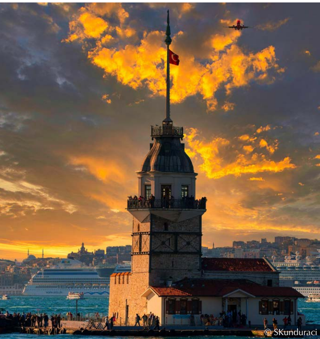
Maiden Tower on the Bosphorus, Istanbul