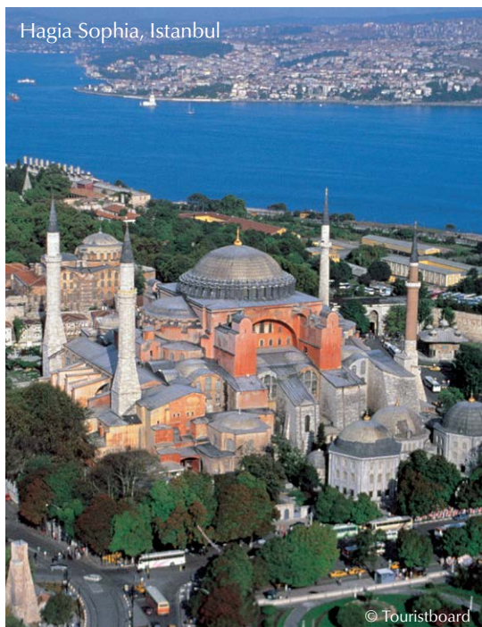
Hagia Sophia, Istanbul

Eos Study Tours, PO Box 938, 47 Main Street, Suite One, Walpole, NH 03608